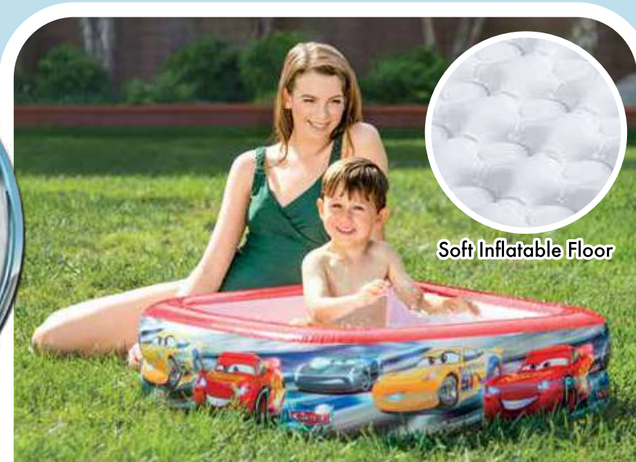
Soft Inflatable Floor