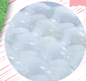
Soft Inflatable Floor